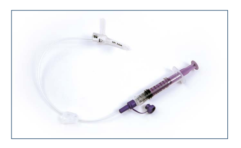
2. Connect ENFit syringe and secure to the tube.