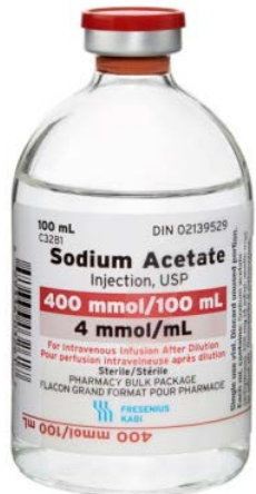
Old Fresenius Kabi Label