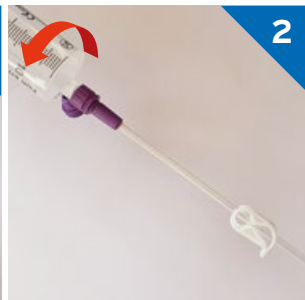
Remove the plunger from the syringe and attach the syringe barrel to the feeding tube or extension set. Close clamp