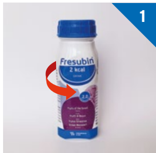
Gently roll EasyBottle